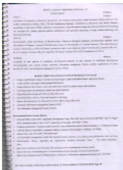
CAP-II, Syllabus, R19 .jpg 3932K