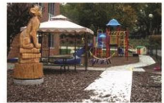
Cutline goes here to explain photo

right goes here. It should all be justified, which means from margin left to margin right, with tabs to intro paragraphs. Text that supports the picture to the right goes here. It should all be justified, which means from margin left to margin right, with tabs to intro paragraphs.