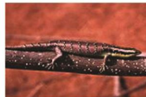
A cut line goes here

Text that supports the picture to the right goes here. It should all be justified, which means from margin left to margin right, with tabs to intro paragraphs. Text that supports the picture to the right goes here. It should all be justified, which means from margin left to margin right, with tabs to intro paragraphs.