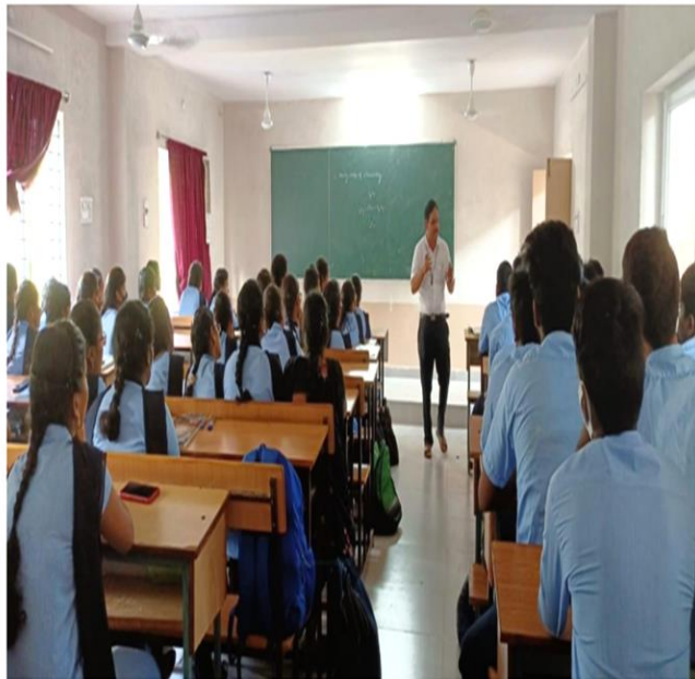
LECTURE ON CHEMISTRY IN DAILY LIFE