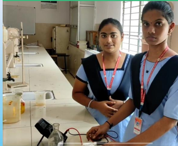
Students (MPCs) made an Aluminum Air Battery which does not require any charge