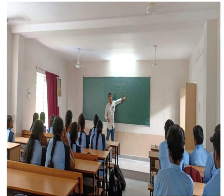
LECTURE ON NUTRITIONAL CLASSIFICATIONS