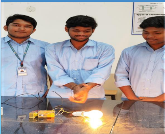
Automatic switch on/off light with sound (clap) made by MPCs students