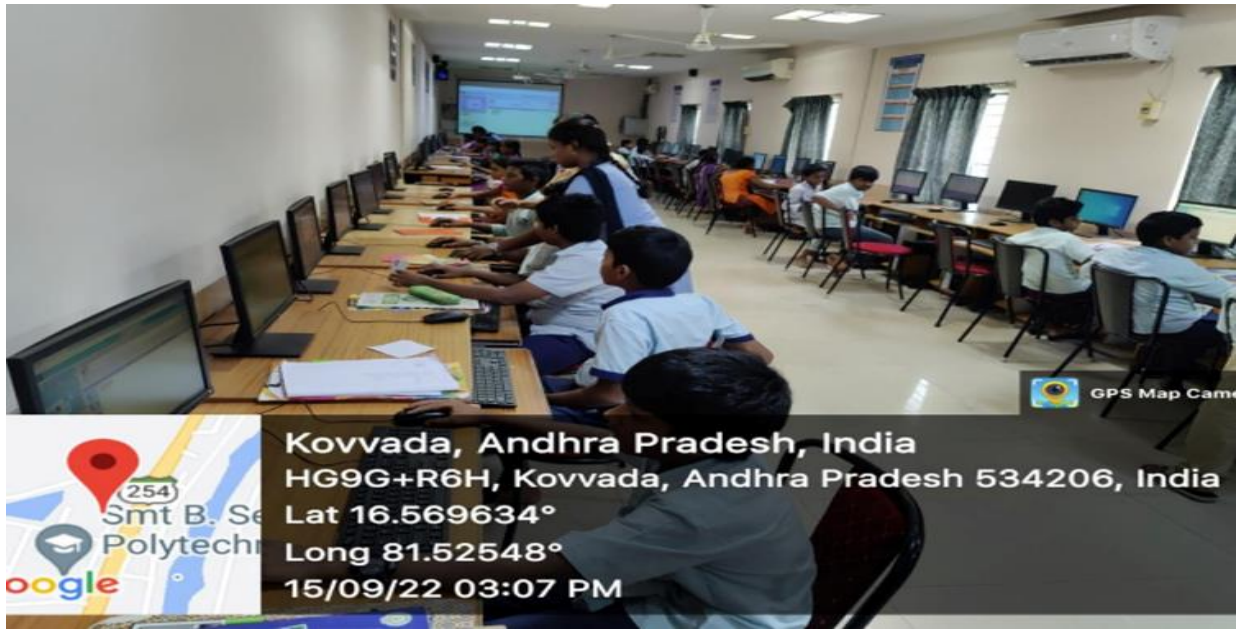
Four Days Program for ZPO H School Vempa and B V Municipal High School Students Bhimavaram-Happy Computing