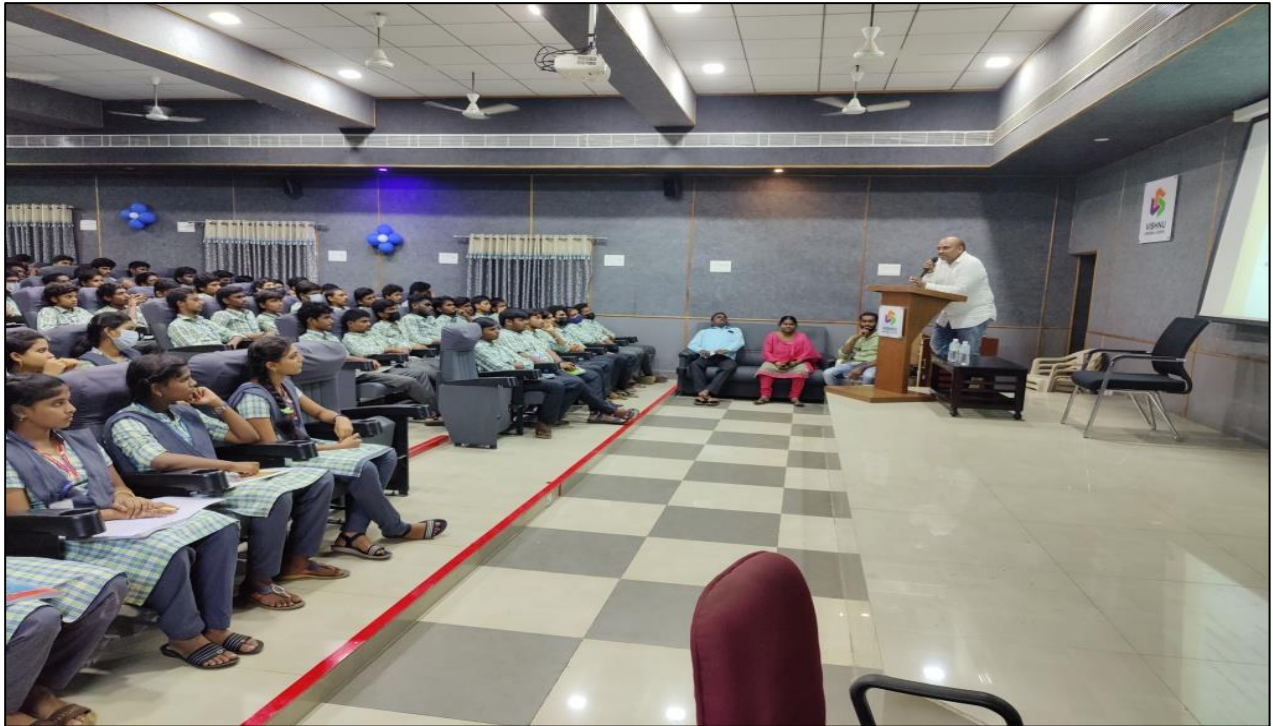
Subject Taught – Computer Networks – Y N College , Narsapuram